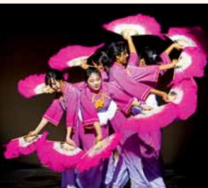
Members of the International Students Association perform during the weeklong Extravaganza.

Winter will begin to break in late March. A slight chance of snow remains but the worst is over. Some warmer days (about 16°C or 60°F) will occur in April and May. By late May and early June, summer will have arrived with temperatures occasionally reaching 33°C (90°F).