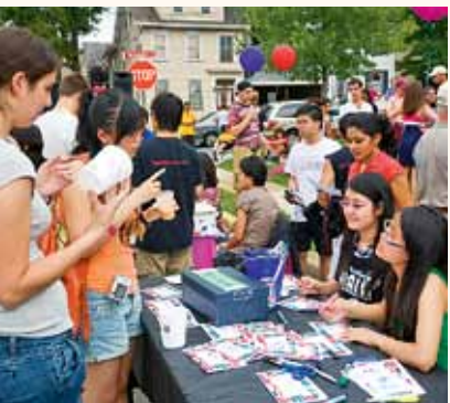
Members of the International Students Association participate in the annual Block pARTy.